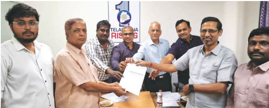
MSEFC Meeting : 11 Arbitration cases and 4 conciliation cases were taken up. One case mutually settled with DD handed over to claimant : 22 nd April, 2025 at Bhongir