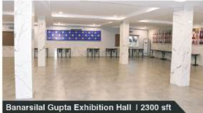
Banarsilal Gupta Exhibition Hall | 2300 sft