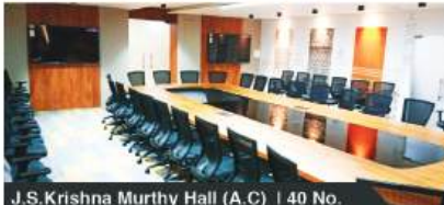
J.S.Krishna Murthy Hall (A.C) | 40 No.

For FTCCI Members 20% Discount on Hall Charges