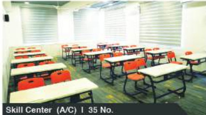
Skill Center (A/C) | 35 No.