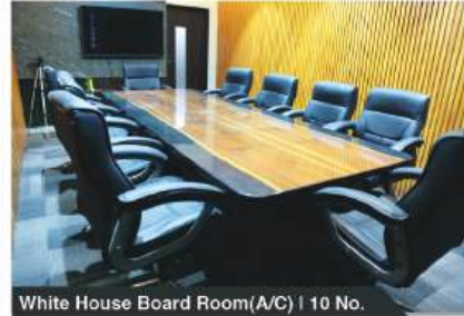
White House Board Room(A/C) | 10 No.