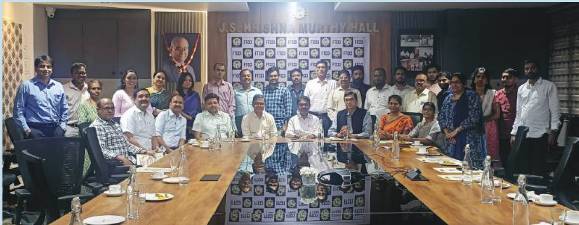
FTCCI Membership Development Committee Meeting : 14 th May, 2025 at Federation House

and large enterprises. The session demonstrated how companies can utilize Dubai’s strategic location to