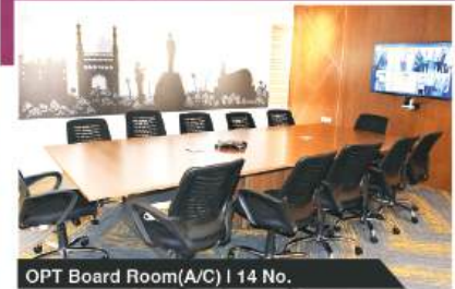
OPT Board Room(A/C) | 14 No.