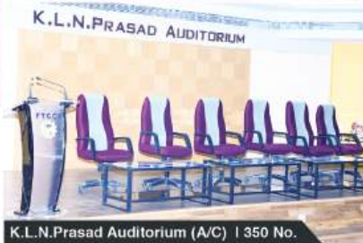
K.L.N.Prasad Auditorium (A/C) | 350 No.