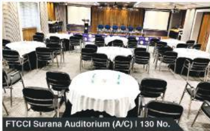
FTCCI Surana Auditorium (A/C) | 130 No.