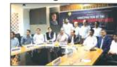
Member News Bureau

Hyderabad: The Federation of Telangana Chambers of Commerce and Industry (FTCCI), the 108-year-old trade, industry, and commerce body based in Hyderabad, along with several other trade and industrial organisations across Telangana, strongly condemned the recent Pahalgam terrorist attack. The Federation expressed deep sympathy with the victims, their families and extended condolences to the bereaved. It also expressed its support to the Government in its resolve to punish the perpetrators and bring them to justice.