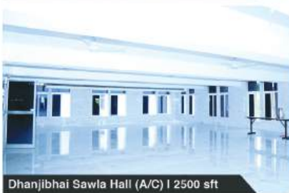
Dhanjibhai Sawla Hall (A/C) | 2500 sft